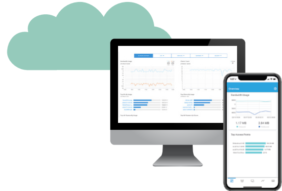
Figure 2. Aruba Central's cloud-based, mobile-friendly management platform